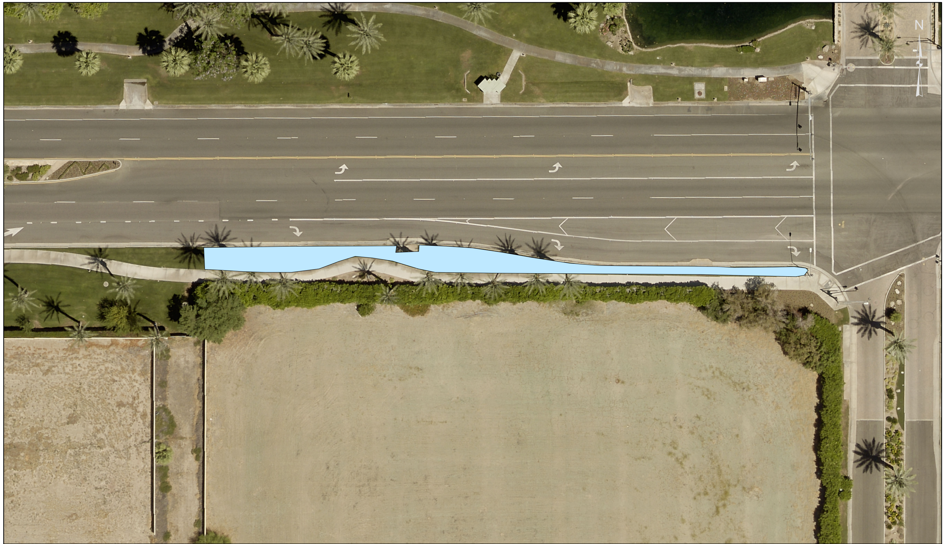
Turf Replacement Areas South Side of Highway 111, west of Rancho Palmeras