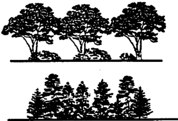
This is a screen: